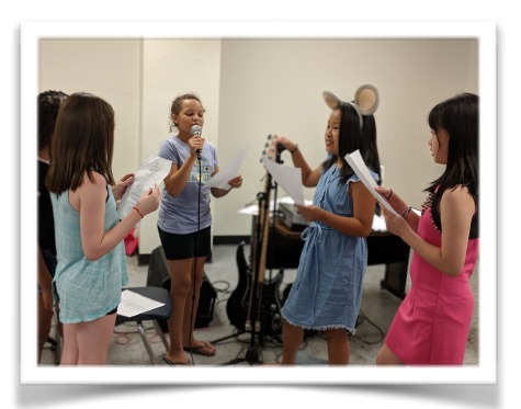
Middle School's new student orientation.